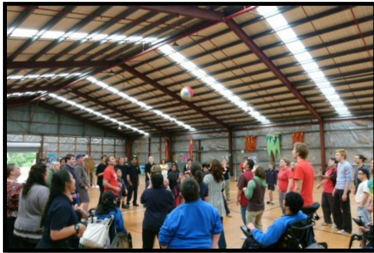
Interact Disability Festival, Auckland 2011