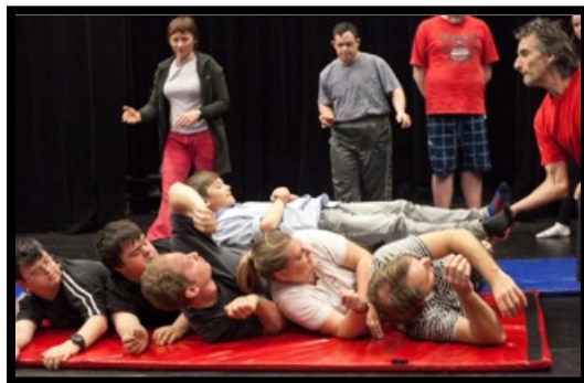
Circability workshops at TAPAC in Auckland, 2012.

As well as learning circus skills, participants of community circus usually apply what they have learnt in a public performance of some kind.