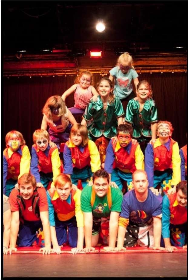
Circolina's Leap performers, Auckland, 2012