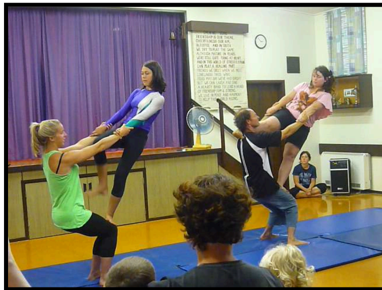
Tauranga Breakaway Programme 2010

Given its significant reported potential for positive outcomes, in the literature some authors ask why community circus is not more prevalent. Reasons given include often unconscious associations of circus with human fears such as a fear of heights, of looking silly, of falling, feeling exposed or ridiculed. Other perceived barriers include health and safety concerns, lack of resources and skills to teach circus and the risk element of circus, which is also considered to be a key part of its appeal. Concern is also expressed that attempts to mainstream community circus might undermine the mystery and magic of circus.