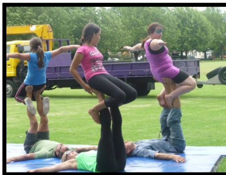
Tauranga Breakaway Programme 2010

Given a constrained funding environment in New Zealand, focusing on strengths, building good relationships and collaboration is required to support community circus to grow.