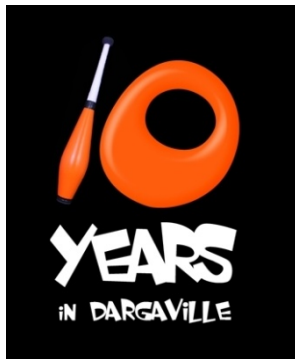
Circus Kumarani celebrate 10 years in Dargaville in 2013

existing groups to strengthen and new groups to establish.