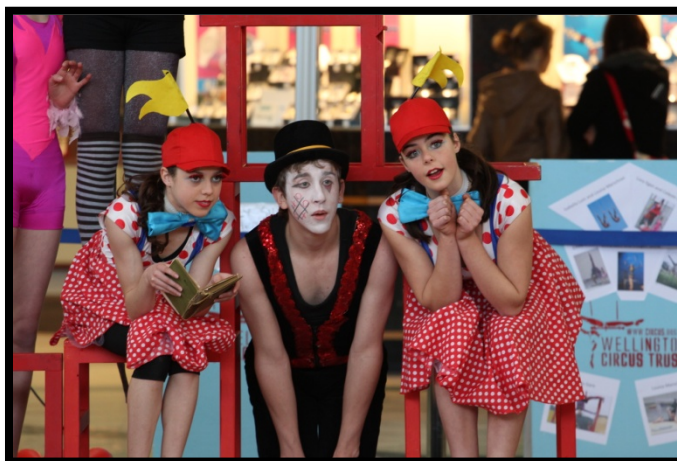
Wellington Circus Trust performers

Overall, community circus tends to be well suited to story based evaluation techniques, visual methods such as Photovoice 3 , participatory methods and longitudinal studies that can show 'downstream' and longer term impacts.