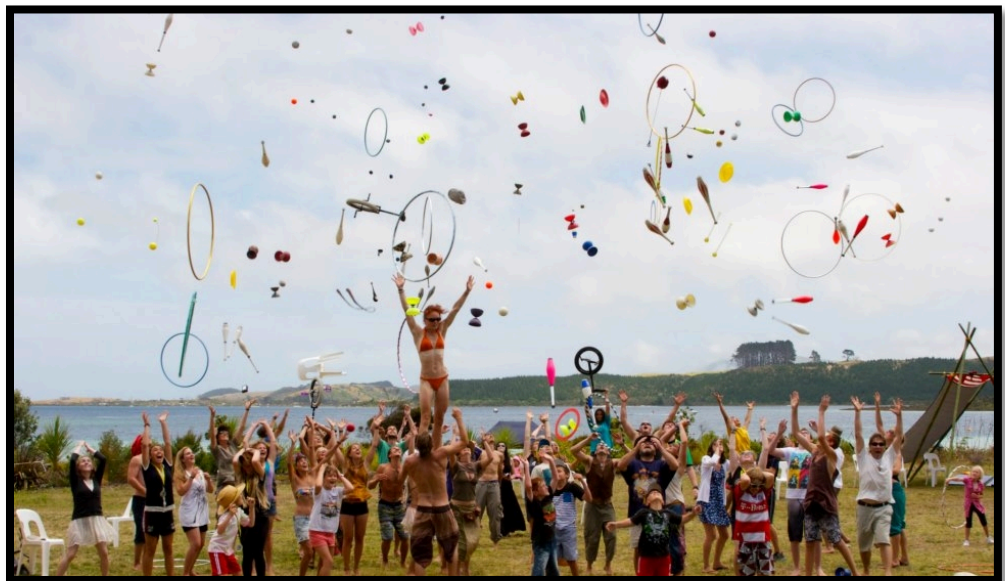
Northland Circus Festival 2013