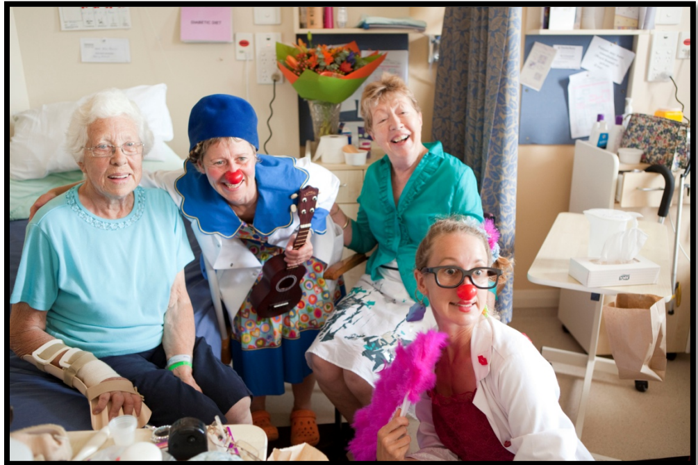
New Zealand Clown Doctors in action – there is now an International Institute for Medical Clowning and our clown doctors are trained in the art of medical clowning.

The possibility of a national centre for community circus was also raised via this research. This could be linked to the creation of new tertiary training opportunities (or the reinstatement of Christchurch Polytechnic Institute's 'Circo Arts' Diploma 5 ), or be explored with existing organisations.